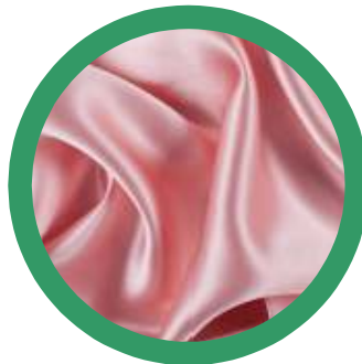
Anaura (rpet Fabric)